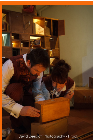
David Beecroft Photography - Proof